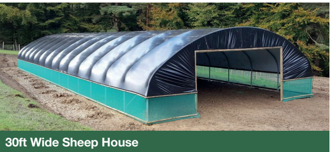
30ft Wide Sheep House