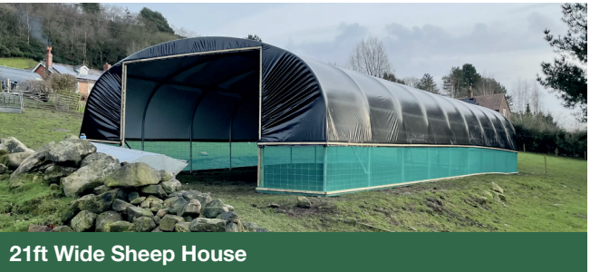
21ft Wide Sheep House