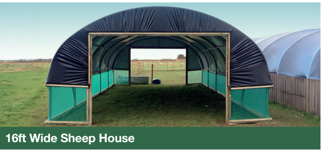
16ft Wide Sheep House