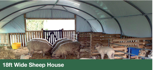
18ft Wide Sheep House