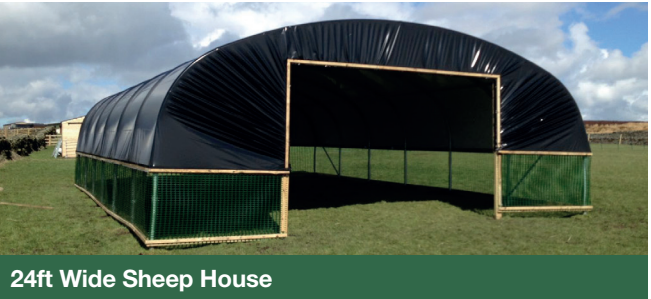
24ft Wide Sheep House