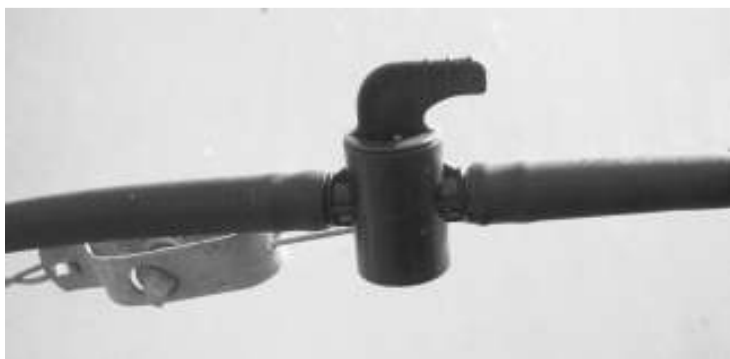
Fig7 - Inline valve

Cut two lengths of 20mm pipe 18-inch shorter than the length of the polytunnel and insert an inline valve in one end with a short 6-inch piece of pipe on the opposite end of the valves (See Fig7). Cable tie these pipes under the two straining wires with the valve at the end of the polytunnel at which the water supply will enter. Insert a 90 Degree elbow in this end of each of the pipes and a bung in the opposite end.